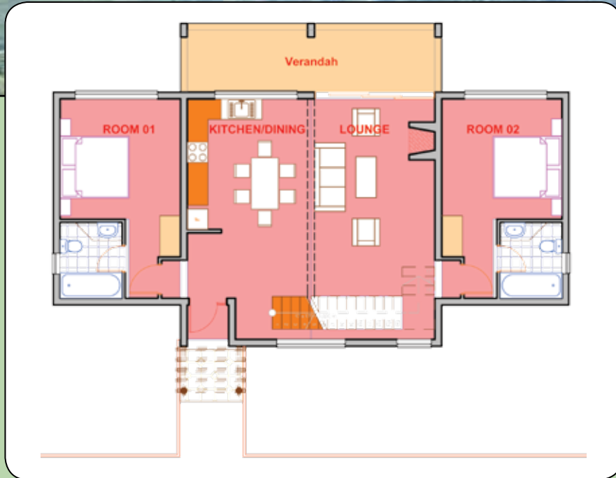
4 Bedroom Unit Ground Floor Plan